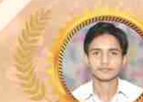
RUPREET SBNIT SURAT